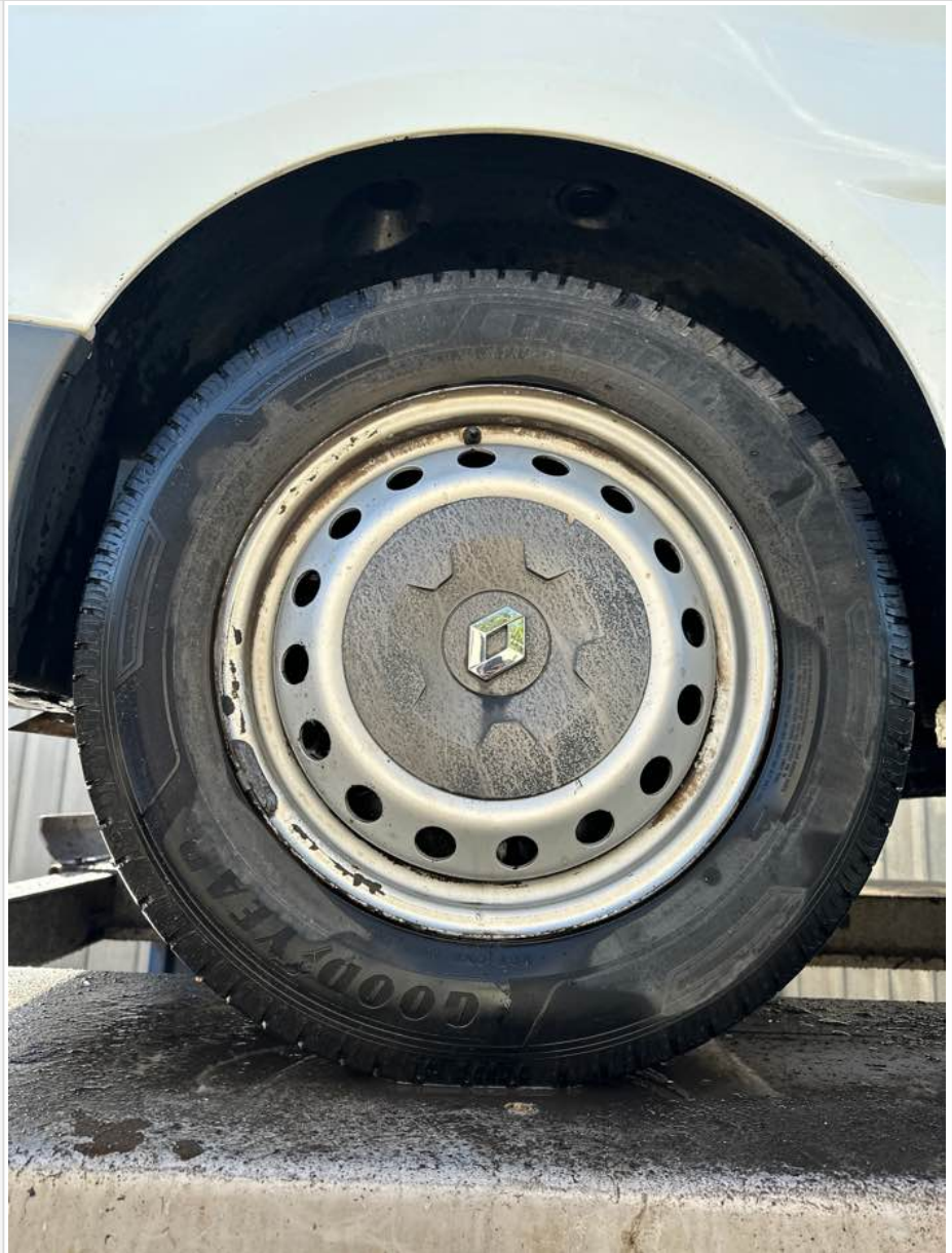
Images of tyre