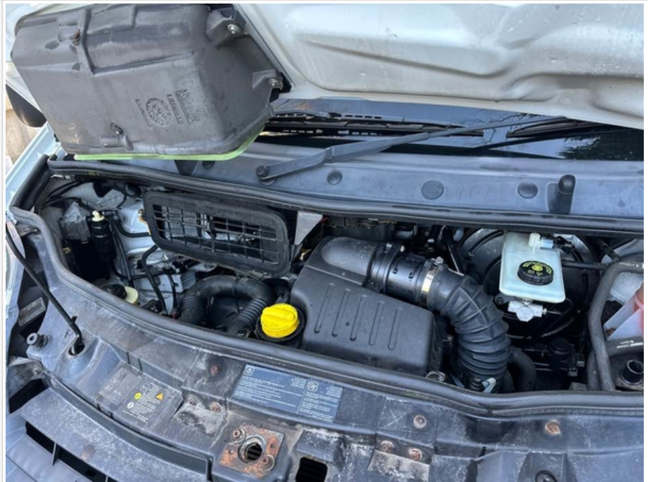
Engine bay photo