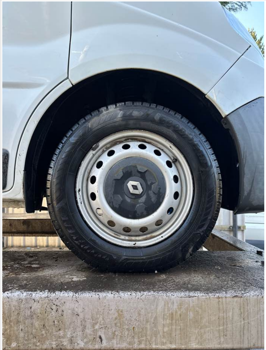
Images of tyre