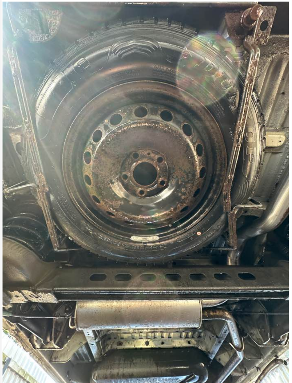
Images of tyre