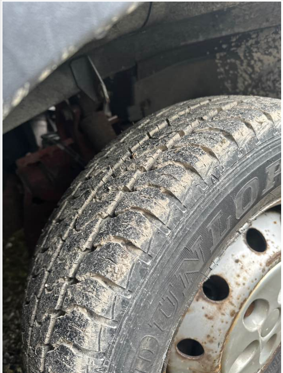
Images of tyre