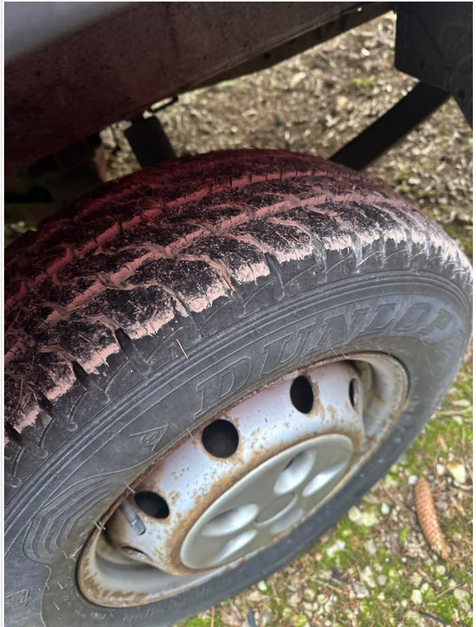
Images of tyre