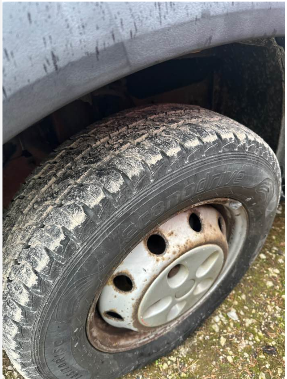
Images of tyre