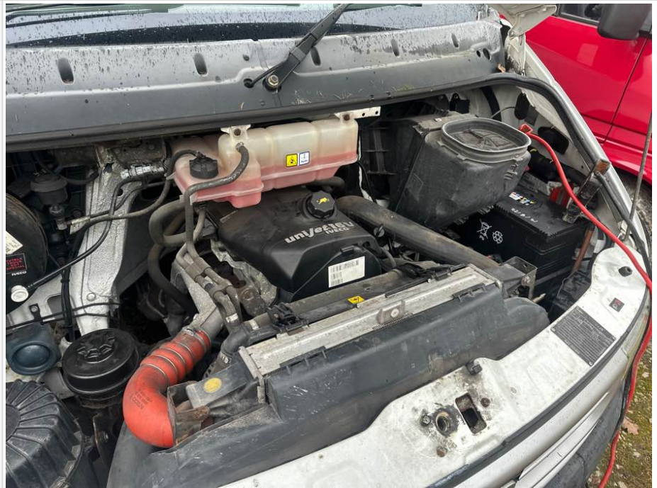
Engine bay photo