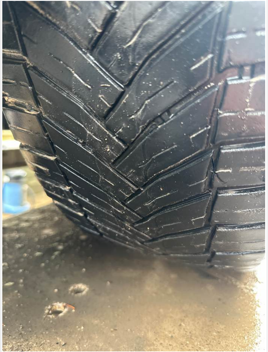
Images of tyre