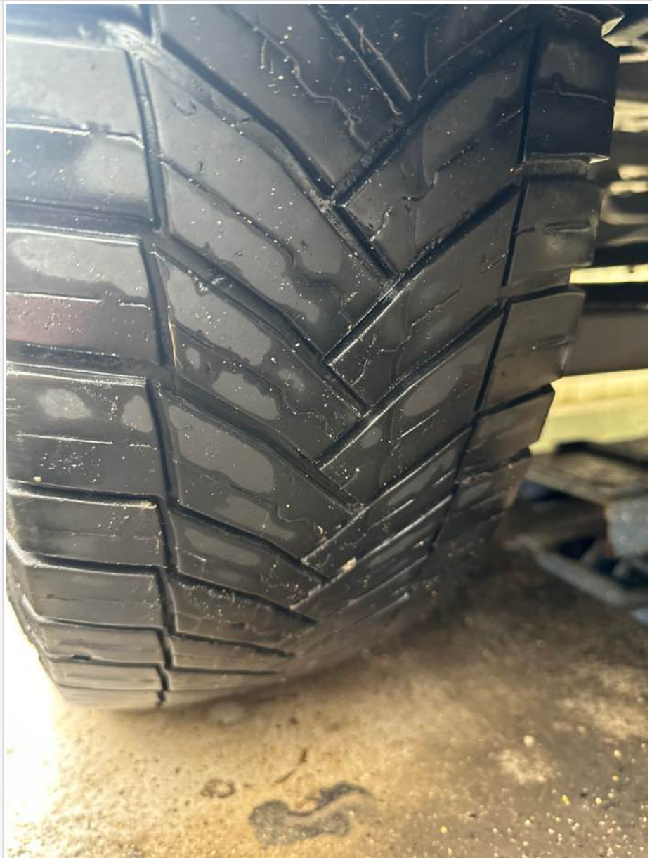
Images of tyre